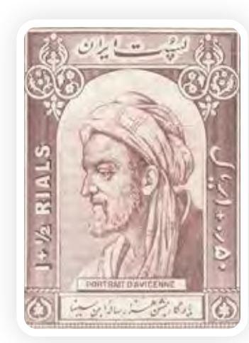
Portrait of Avicenna on a 1950 Iranian postage stamp