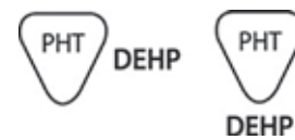
Figure 3 These symbol arrangements indicate the inclusion of the phthalate DEHP within the packaged product

Given the European concern over phthalates and DEHP in particular, the amended Medical Device Directive 2007/47/EC introduced compulsory labelling from March 2010 indicating the inclusion of a phthalate (PHT) and specifically which one 12 (Figure 3).