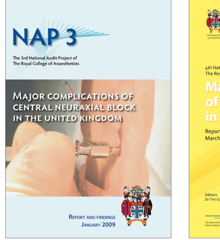
Figure 2.1 Previous NAPs